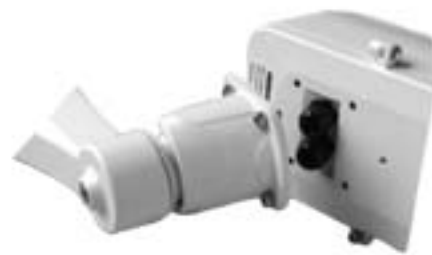
Easy mounting of the bracket with only 4 allen head screws